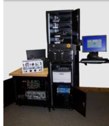
RADIAC INTEGRATED TEST SUITE (RITES)