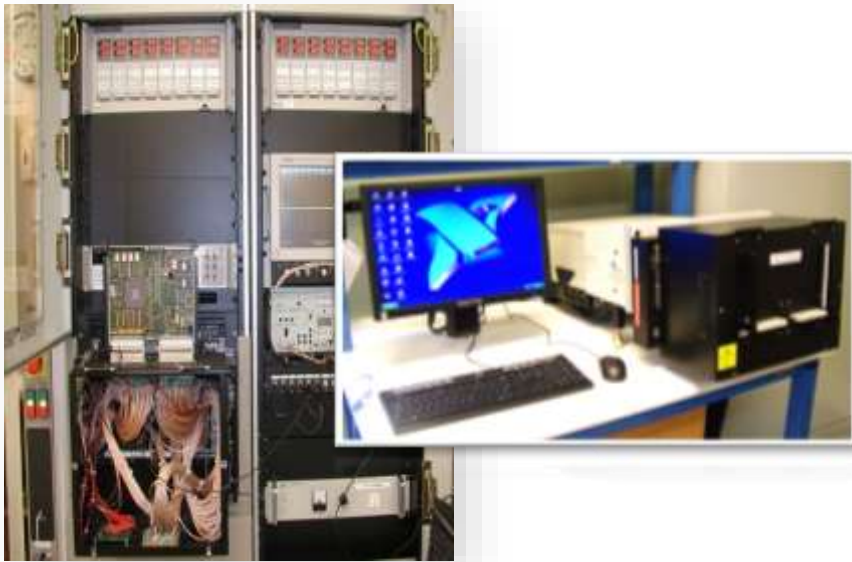
COMPACT TEST SYSTEM