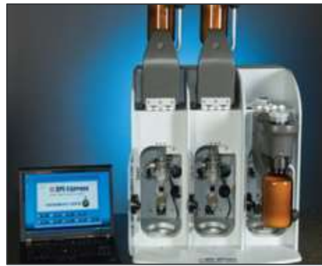
SOLID PHASE EXTRACTION SYSTEM